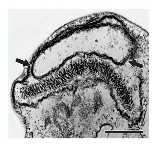
FIGURE 3: Common drug effects on the pathogenic trypanosomatid mitochondrion. Treatment with a naphthoquinone leads to mitochondrial swelling (asterisk) and the appearance of concentric membranar structures inside the organelle (arrows). K: typical morphology of the kDNA network. Bar: 200 nm.

The mitochondrial metabolism of Leishmania spp. amastigotes and promastigotes, T. cruzi trypomastigotes and epimastigotes, and T. brucei procyclic forms is similar [53]. The inhibition of certain potential targets is associated with triggering apoptosis-like effects by MMP impairment and/or ROS production. The mitochondrial targeting of drugs may rely on free-radical production and/or calcium homeostasis [116].