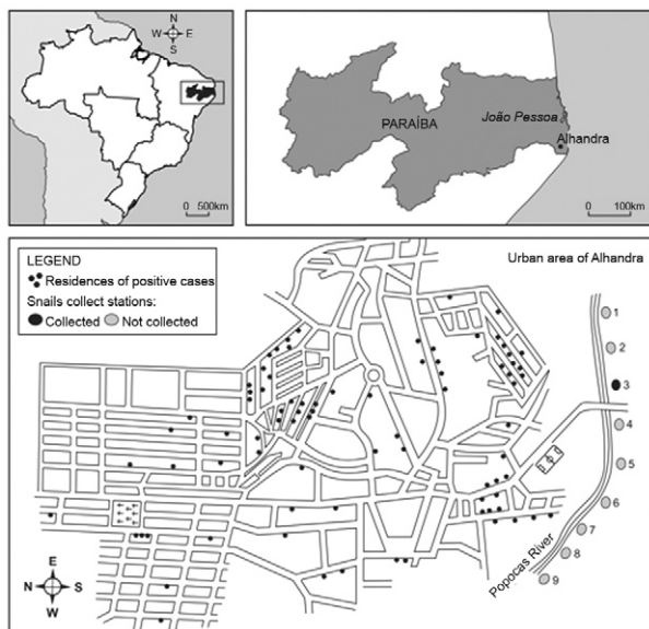
Fig. 1: location of Alhandra, state of Paraíba, Brazil, showing the main settlement of the municipality with the residences of positive case for Schistosoma mansoni and the Popocas River with the snails collect stations.

The Popocas River, which borders the main settlement of the municipality of Alhandra, is the primary and the closest source of infection by S. mansoni . Given that the population uses this river and wells derived from it for bathing, laundering, fishing and other activities, nine capture sites for the planorbid intermediate host of S. mansoni were chosen in this area (Fig. 2). Two capture periods were planned: the rainy season, from May-September and the dry season, from October-December. The capture sites and derived wells were surveyed every two months during both seasons in accordance with the recommendations of the WHO. When molluscs were found, they were counted and classified and were subjected to a process to induce elimination of cercariae. The elimination rates were also evaluated. A random sample of molluscs was placed in boxes covered with moist gauze and was forwarded to the Malacology Laboratory of the Oswaldo Cruz Institute, for confirmation of the species classification and emergence of cercariae. The procedures for accessing, collecting and evaluating the infected snails were the same in 1979 and 2010.