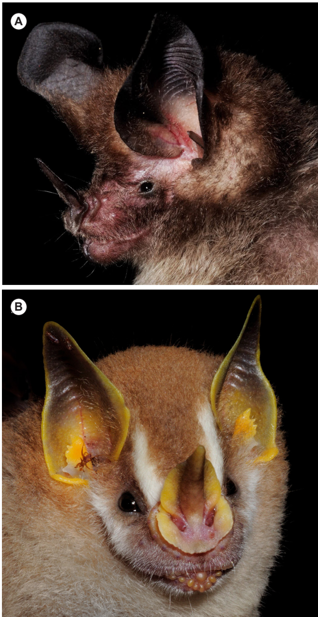
FIGURE 2. Bats collected in a cerrado area in the municipality of Ribeiro Gonçalves, state of Piauí, Brazil: A) Micronycteris hirsuta and B) Dermanura gnoma.