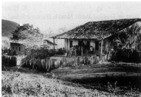
Fig. 2. Houses CEM 21 and CEM 22 in Barreiro Vermelho. Note the crevices between bricks where the wall is unplastered, the maize store behind the houses, and the proximity of the woodland in the background.

Two of the houses were of mud and wattle construction with unplastered walls, while the