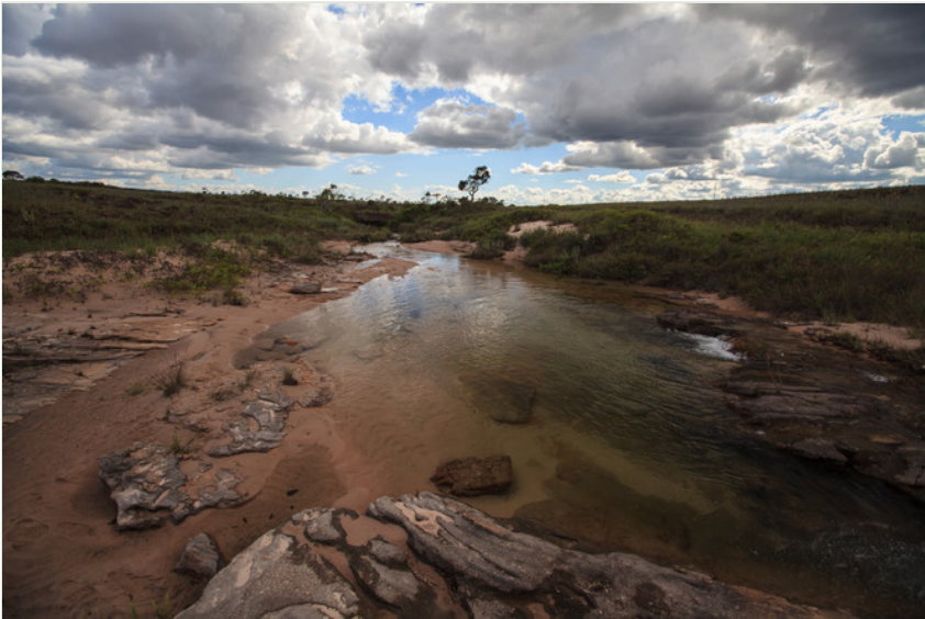
Figure 14. Photograph of collecting locality Biocor 17 in Bolívar State, Venezuela.