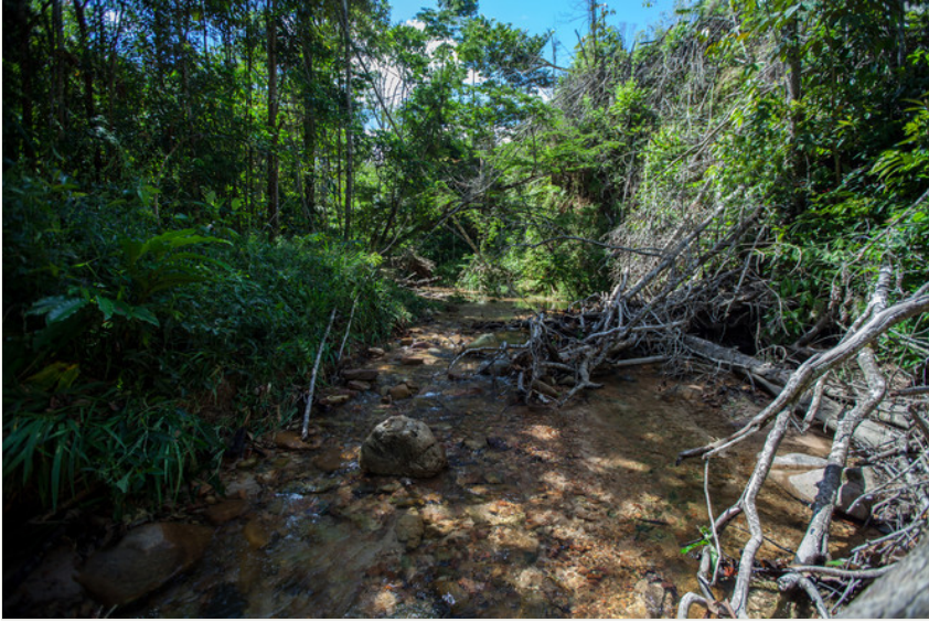
Figure 13. Photograph of collecting locality Biocor 16 in Bolívar State, Venezuela.