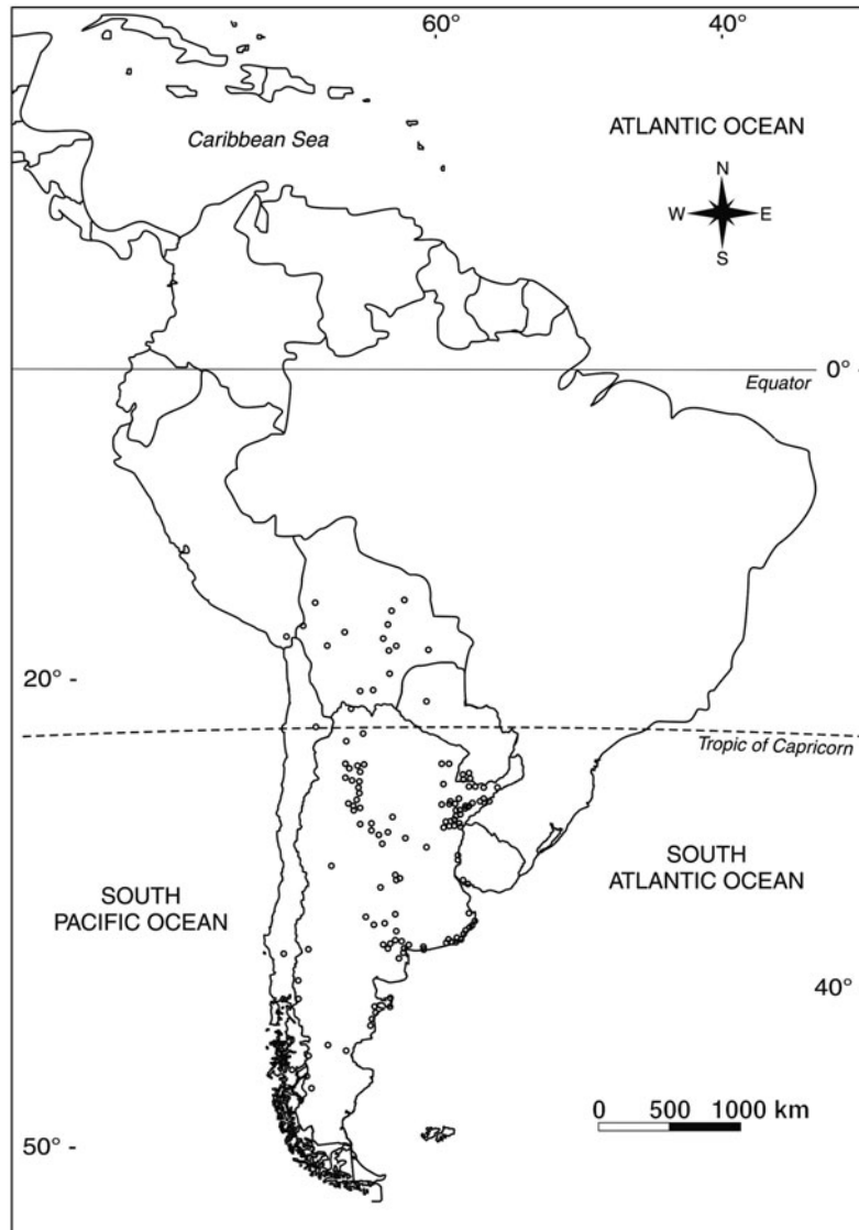
Figure 1 Geographic distribution of Ctenomys populations studied in this paper. See Medina et al. (2007) for references to all localities.