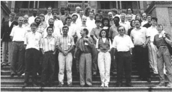
Fig. 2. Group photograph of the participants of the FIOCRUZ-TDR Parasite Genome Network Planning Meeting, held in Rio de Janeiro, Brazil, on 14 and 15 April 1994. This international meeting, attended by 40 scientists and 5 representatives from WHO, selected the three parasite strains whose genome sequences are published in this issue of Science by the Tritryp project.

investigators (34). The India–Brazil–South Africa Dialogue Forum, established in June 2003, includes a focus on intellectual property and access to medicine, traditional medicine, and R&D on vaccines and pharmaceutical products to address national health priorities. The Technological Network on HIV/AIDS, which was announced in Bangkok during the July 2004 International AIDS Conference, includes Brazil, China, Cuba, Nigeria, Russia, Thailand, and Ukraine (with perhaps India and South Africa joining in the near future). The Network supports research and South-South technology transfer to develop and manufacture antiretroviral drugs and new drug formulations, male and female condoms, microbicides, and HIV vaccines. Finally, the WHO Developing Countries' Vaccine Regulators Network, created in September 2004, involves Brazil, China, Cuba, India, Indonesia, Russia, South Africa, South Korea, and Thailand.