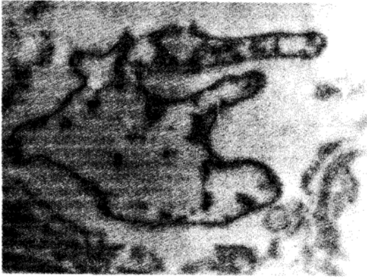
Figura 2 and 3 – Positive specific deposits immunolabeled with peroxidase on the membrane of dendritic cell cytoplasmic processes (treated mice: parasitologically negative and serologically positive). X 7.000 and 12.000

Nota Prévia. Andrade SG, Freiras LAR, Peyrol S, Pimentel AR, Sadigursky M. Trypanosoma cruzi antigens detected by immunoelectron microscopy in the spleen of mice serologically positive but parasitologically cured by chemotherapy (Preliminary Report). Revista da Sociedade Brasileira de Medicina Tropical 21: 41-42, Jan-Mar, 1988