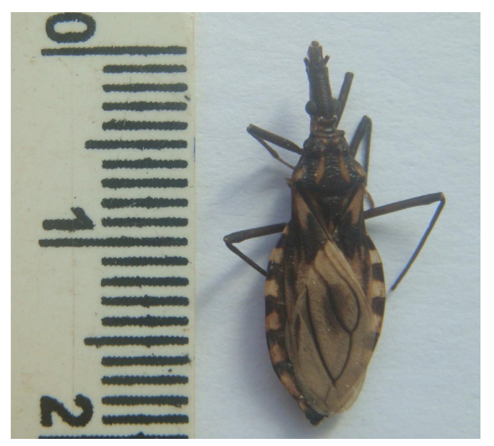
FIGURE 1. Triatoma petrocchiae specimen (female) from municipality of Ipaumirim, state of Ceará, Brazil.

The updated geographic distribution map of T. petrocchiae (Figure 2) presents the known records in the