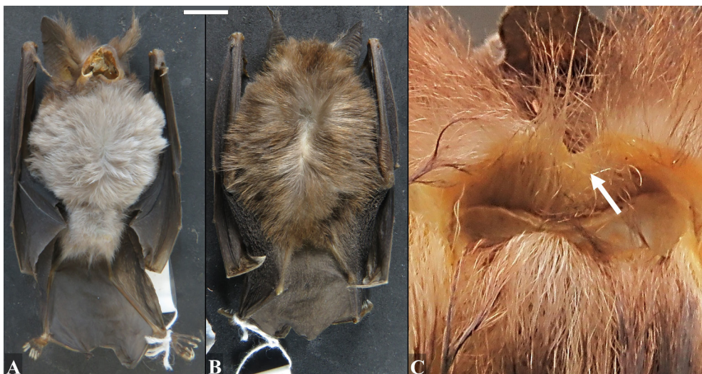
Fig. 1. Micronycteris schmidtorum from Alagoas, Northeastern Brazil (MUFAL 0245): A. Pale gray ventral fur, B. Dorsal fur; C. white arrow indicates the interauricular membrane with a moderate notch. Scale bar=10 mm.