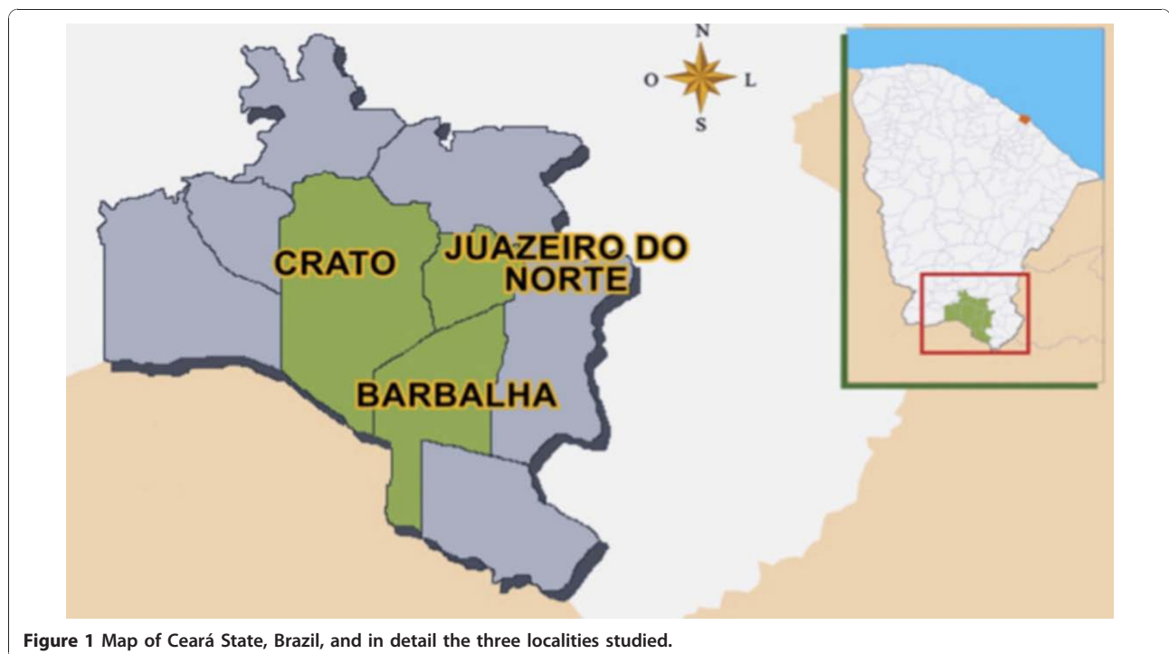
Figure 1 Map of Ceará State, Brazil, and in detail the three localities studied.

Dose-response bioassays were undertaken according to the methodology proposed by the World Health Organization to evaluate larval susceptibility to temephos [36]. In these experiments, third-instar larvae (L3) were