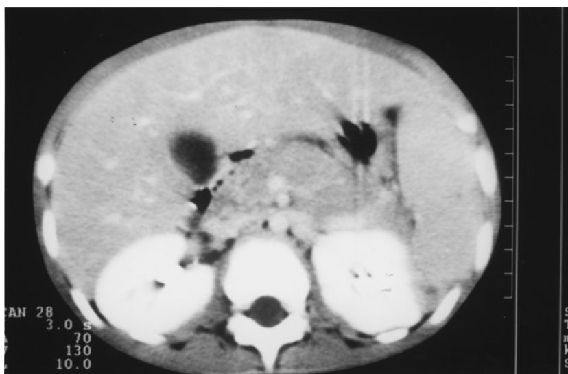
FIG. 2. CT scan of abdomen with enlargement of lymph nodes and hepatosplenomegaly.

Thoracic and abdominal CT scan demonstrated lymph nodes in the mediastinum and in the intra-abdominal region, as well as hepatosplenomegaly,