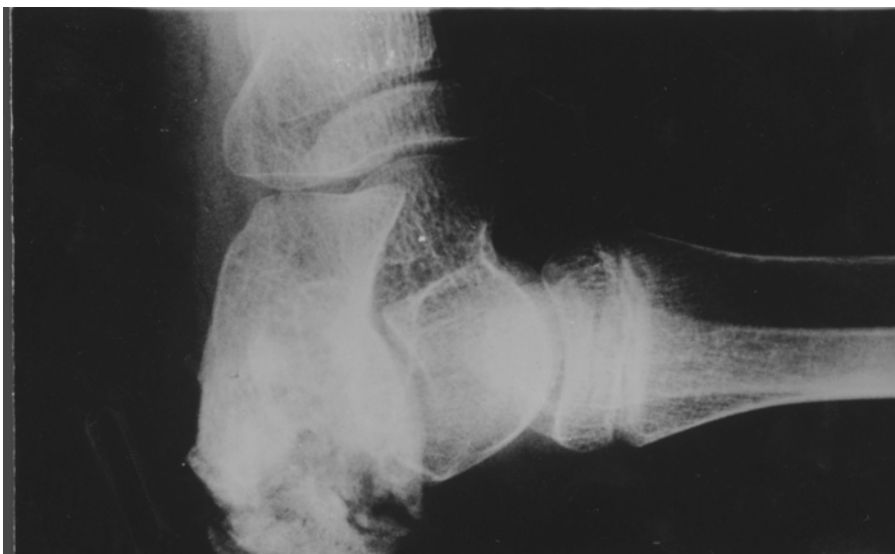
FIG. 1. Roentgenogram of right calcaneus with osteolytic lesion.

With no improvement after 10 days, incision and drainage was performed. The aspirated material was tested by microscopic examination and culture for bacteria, all of which were negative. She continued with fever, and a haemogram revealed a leukocytosis and an increased sedimentation rate, at which time oxacillin was stopped and vancomycin added. At this time cutaneous lesions similar to molluscum contagiosum, subcutaneous nodules, and hepato-