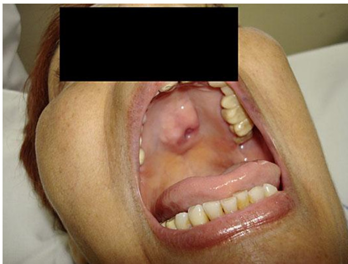
Fig. 1. Depression on the mucosal tissue on the left side of the torus palatinus; no bone exposure or signs of inflammation and/or infection.