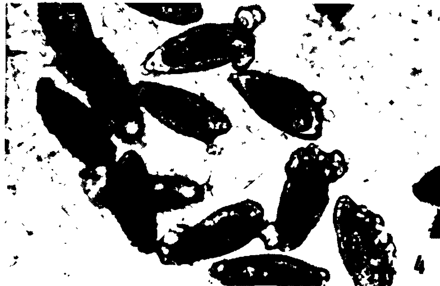
Eggs found in intestinal mucosa of Nectomys squamipes - Figs 1, 2, 3: eggs with usual aspect. Direct examination x 125 (Figs 1, 2). Direct examination x 500 (Fig. 3). Fig. 4: eggs with abnormal protuberances in its covering membrane.