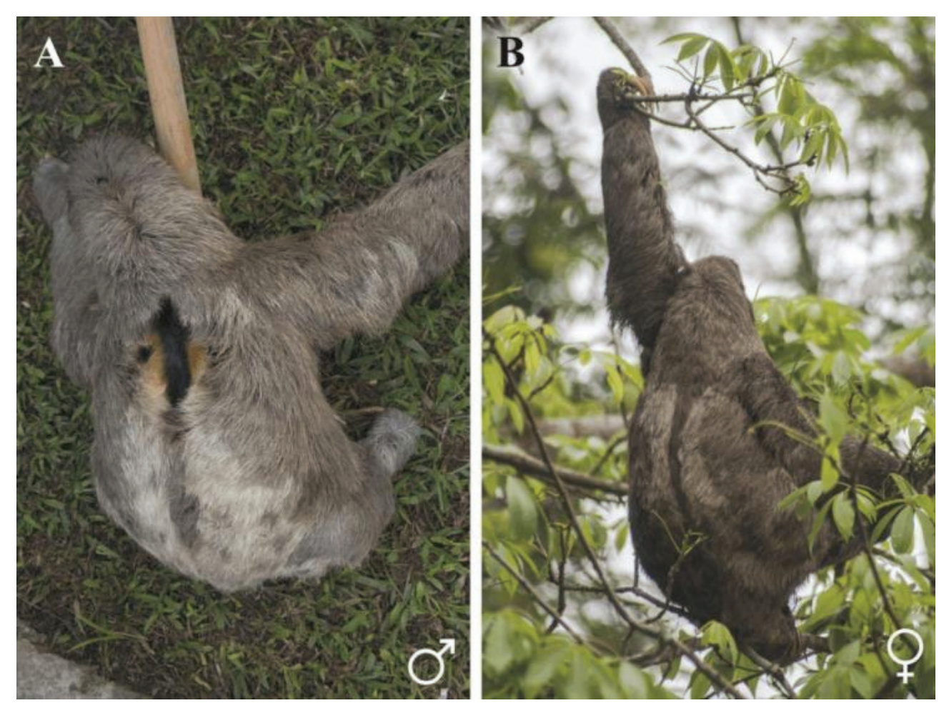
Figure 1. Dorsal view of an adult male (A) and female (B) of Bradypus variegatus captured in the Campus Fiocruz Mata Atlântica, State of Rio de Janeiro, Brazil.

The staff of the Project for Fauna Management and Zoonoses Surveillance (PMVS/CFMA-FIOCRUZ) is frequently called to remove sloths out of a garden or from the street, and sometimes we receive animals that were captured by pedestrians. We use physical restraint to transport