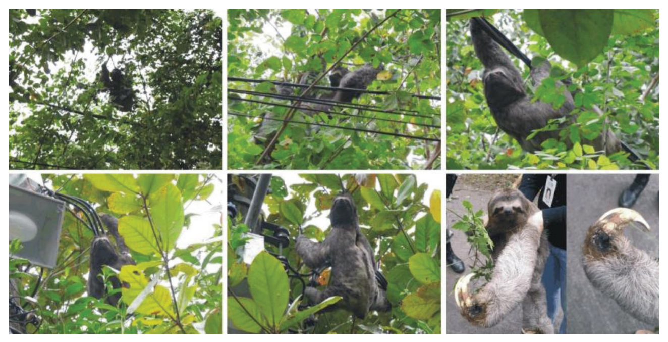
Figure 5. Sequence of images at Campus Fiocruz Mata Atlântica boundaries of an electrocuted Bradypus variegatus resulting in two burned claws.

2010, Lima et al. 2012). The greatest threat for sloths in our studied region seems to be the urbanization. Human occupation of a wild area, including the presence of domestic animals, highway network and electrical grid, increases the risk of accidental events involving sloths.