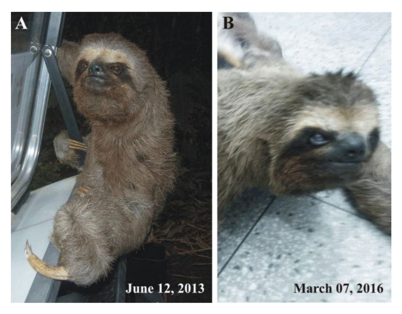
Figure 4. a) Sloth 3 captured on June 12, 2013, showing healthy eyes. b) Sloth 3 recaptured on March 07, 2016, showing injured right eye.

Although B. variegatus is listed in CITES Appendix II (2017), in most of its distribution it does not appear to suffer a major threat (Moraes-Barros et al. 2014). Sloths are not commonly listed in studies on hunting in the Atlantic Forest (Cassano 2006), however they can be hunted at random events, especially when found on the ground while crossing open areas (Oliver & Santos 1991). One of the main causes of accidents for B. variegatus is electrocution in high tension wires used by the animals as support to move, leading to violent shocks that cause burns, amputations and death (Martínez et al. 2004, Souza-Junior et al.