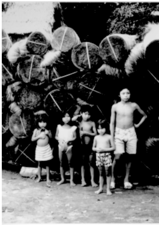
Fig. 3: piaçavas fibers collected and stored for transportation.

Cross-serological reaction with antibodies from cutaneous leishmaniasis, leprosy, tuberculosis and T. rangeli could be a possibility in some cases. In the present study we found only four cases of cutaneous leishmaniasis, two cases of leprosy and two of tuberculosis and we have not found by xenodiagnosis any case of T. rangeli infection. However the contact of the population with triatomines of the genus Rhodnius gives rise to great risk of transmission of that parasite, as we have shown (Coura et al. 1996), by diagnosing three human cases in 86 hemocultures in the Brazilian Amazon.