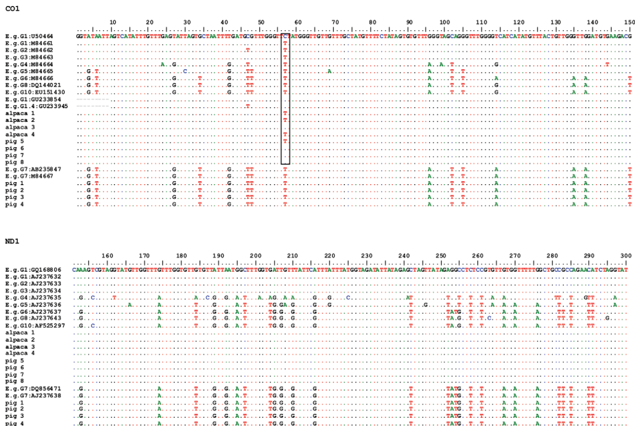
Fig. 1: nucleotide sequences of partial regions of the cytochrome C oxidase subunit 1 (CO1) (399 bp) and NADH dehydrogenase subunit 1 (ND1) (756 bp) genes for 12 Peruvian isolates of Echinococcus granulosus aligned with reference sequences deposited in GenBank. All sequences from alpaca and four from pigs are referenced to the G1 genotype; other four sequences from pig are referenced to the G7 genotype, for both mitochondrial genes. Deviations from the G1 sequence are displayed as individual nucleotides. The boxed region denotes a base pair that distinguishes the two reference sequences for G1.