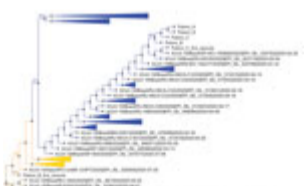
Figure 2. Phylogenetic analysis of severe acute respiratory syndrome coronavirus 2 genomes from reinfected patients, Brazil, 2020. Representative genomes deposited in GISAID (Appendix Table 1, Figure 3) were compared with sequences...

Patient B shares a household with patients C and D, a married couple, both 34 years old. Patients C and D were not in social isolation because of their work duties. Although patient C was asymptomatic, he displayed a C_t of 35.71 ( 10^3 copies/mL) on March 25 (Table). Patient D was negative by molecular testing on March 26, but 1 week later, she had a detectable viral load ( C_t 36.01, 10^3 copies/mL) and reported diarrhea in the following days (Table). On March 27, all 4 patients experienced an increase of inflammatory mediators (interleukin [IL] 6, IL-8, and tumor necrosis factor \alpha ) and regulatory (IL-10) and chemotactic (C-X-C motif chemokine ligand 10) and antiviral (interferon \gamma ) signals, relative to healthy SARS-CoV-2-negative controls (Figure 1). Although cytokine response was consistent with the resolution of the infection, the anti-SARS-CoV-2 neutralizing humoral response was not detected in late March 2020 (Table; Appendix Figure 2).