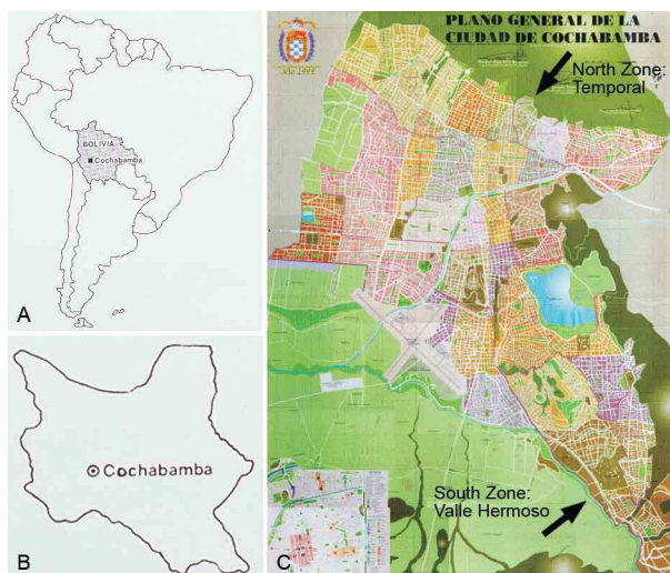
Fig. 1: map of South America (A), showing the location of Bolivia, department and city of Cochabamba (B) and the two studied areas (C) of Valle Hermoso and Temporal, in the South and North zones, respectively.

Serology with IHA and direct enzyme-linked immunosorbent assay (ELISA) - IHA was performed using a commercially available diagnostic kit (Polychaco, Buenos Aires, Argentina). The serum was diluted 1/16, 1/32, and 1/64, and positive and negative controls were employed for all test plates. This assay was also used to analyze the dog serum samples. ELISA was performed using a commercial available kit (Chagastest, Buenos Aires, Argentina) and as with the IHA analysis, positive and negative controls provided in the kit were used with all samples.