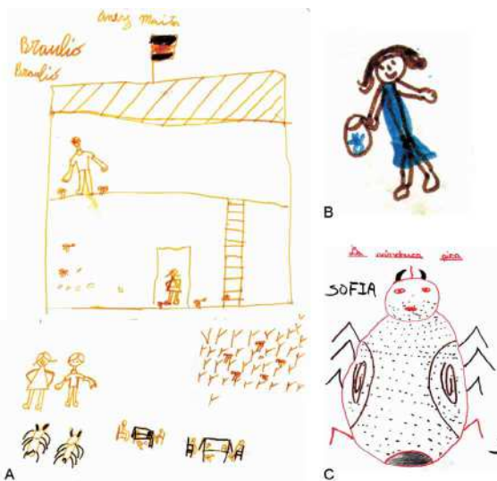
Fig. 4: draws made by Bolivian children related to triatomine knowledge.

a : significant differences (p < 0.05) between South and North zones. b : IHA and ELISA.