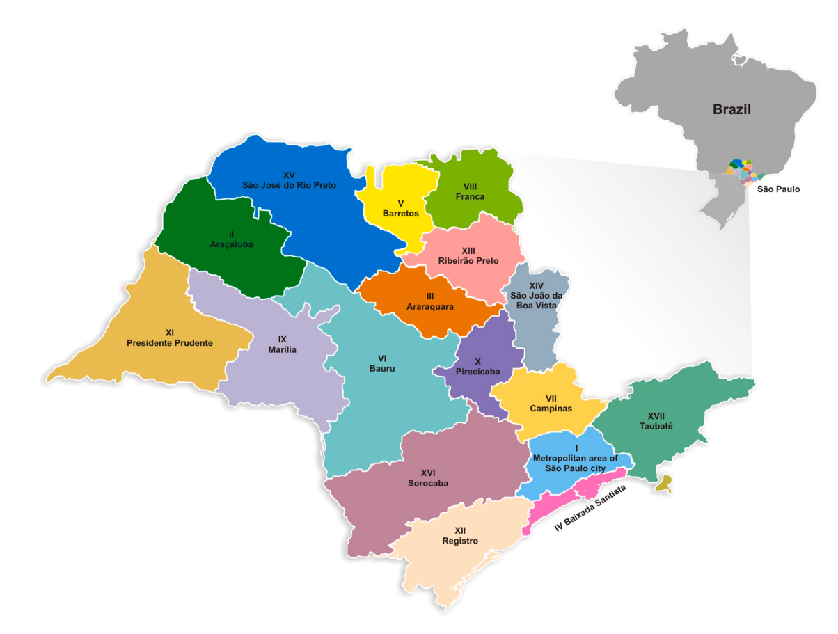
Fig. 1. Division of the São Paulo State in Regional Health Departments. The São Paulo State is divided in 17 Regional Health Departments which are identified by roman numbers.

From February to August 2021 the Network for Pandemic Alert of