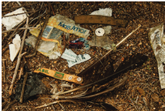
Figure 3. Materials of anthropic origin found in nests of Pseudoseisura cristata in Tauá, state of Ceará: razor blades, shaver, fork, broken glasses, metal fragments, fragments of plastic objects, wire, barbed wire, plastic sandal straps, paper, plastic lid, pieces of plastic bags, gas cylinder plastic label. Also, snake skins and large feathers.