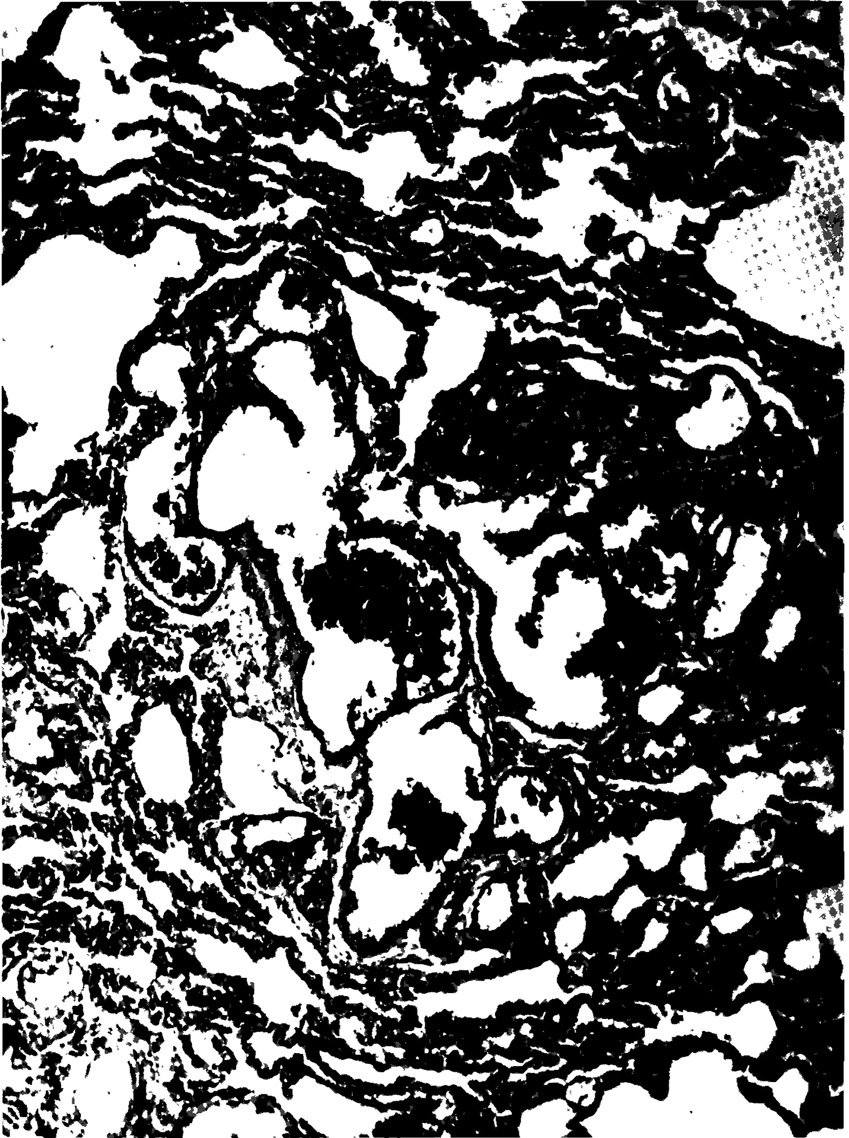
Fig. 3: section of a pulmonary artery showing a plexiform lesion from a case of schistosomal cor pulmonale . There is a labyrinth formed by numerous vascular lumina, both inside and outside the walls of the primitive artery. Hematoxylin and Eosin. X 150.