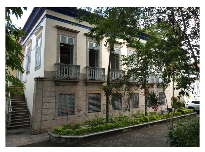
Figure 2. Juliano Moreira 's residence at the side of the Hospício Nacional dos Alienados .