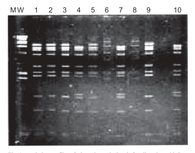
Fig. 1: restriction profiles of adenoviruses isolated after digestion with Sma I. MW: molecular weight marker. Lines - 1, 2, 3, 5, and 9 (Ad2); Lines - 4, 7, and 10 (Ad1); Lines - 6 and 8 (Ad7).