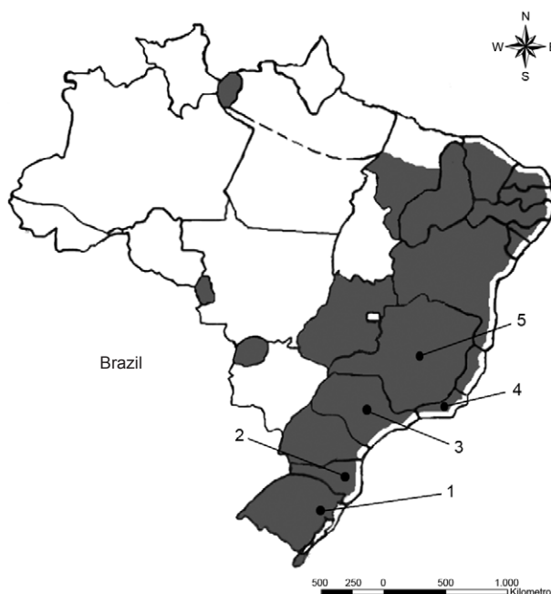
Fig. 3: map of Panstrongylus megistus distribution (area in gray [modified from Carcavallo et al. (1999)]) and the principal findings of sylvatic foci in different Brazilian states. 1: state of Rio Grande do Sul (hollow trees) (Santos-Jr 2007); 2: state of Santa Catarina (hollow trees and Bromeliaceae) (Leal et al. 1961, Schlempler-Jr et al. 1985, Grisard et al. 2000); 3: state of São Paulo (hollow trees, anfractuositities, bromeliads, palms and rock shelters) (Barretto et al. 1964, Barretto 1967, Forattini et al. 1970, 1977, 1978); 4: state of Rio de Janeiro (hollow trees) (Miles et al. 1982); 5: state of Minas Gerais (hollow trees, tree holes, palms and burrows in the floor) (Barretto et al. 1978, Neves 1979, Santos-Júnior et al. 2011, the present paper).