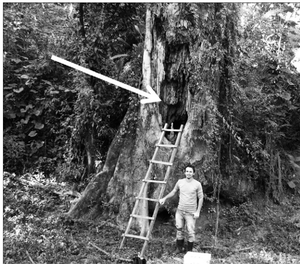
Fig. 2: natural ecotope of Panstrongylus megistus found in the municipality of Bambuí, state of Minas Gerais, Brazil (the white arrow indicates the entrance of the hollow).

between natural ecotopes and dwellings (Dias 1982, Fernandes et al. 1994). The low rates of re-infestation (10%) and domiciliary colonies (20%) observed in residences evaluated between 2004-2009 suggest that the sylvatic environment is the main source of household recolonisation. The expansion of monocultures such as beans, corn and especially sugarcane has reduced the original vegetation in the municipality over recent decades. Such land use change has led to a reduction in the natural resources used as shelter and food by the triatomines; these resources previously supported high rates of domestic invasion (Forattini et al. 1978). In an epidemiological study in Bambuí, Fernandes et al. (1992) observed that P. megistus captured inside dwellings showed higher feeding preference for humans and dogs and warned that vector-borne Chagas disease in the municipality could resurge if the triatomine control program were interrupted. The data presented here suggest that even with a low rate of infestation in sylvatic habitats, the colonisation of domiciliary environments has been extensive and ongoing throughout the municipality. We conclude that an active surveillance program is necessary to contain household infestations.