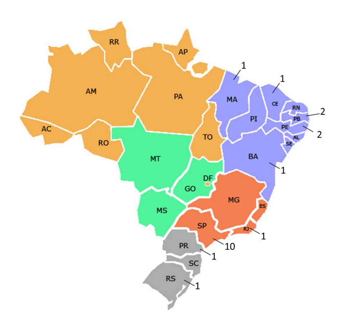
Figure 1. Regional distribution of centres participating in the Brazilian Multicentre Study on Preterm Birth (2 in region South, 7 in region Northeast and 11 in region Southeast). doi:10.1371/journal.pone.0109069.q001

This is a multicentre cross-sectional study plus a nested casecontrol component implemented in a research network of 20 referral obstetrical hospitals in different geographical regions of Brazil (Figure 1) [17]. Ranging from a four to nine months period depending on the amount of deliveries, from April 2011 to July 2012, the participating centres performed a prospective surveillance of all patients admitted for delivery, in order to identify preterm births and their main determinant factors. An analysis of risk factors associated with SPB was also planned, comparing