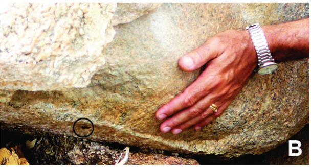
Fig. 2: attack of adult (A) and nymph (B) of Triatoma brasiliensis (with extended proboscis) in the wild environment during the day.