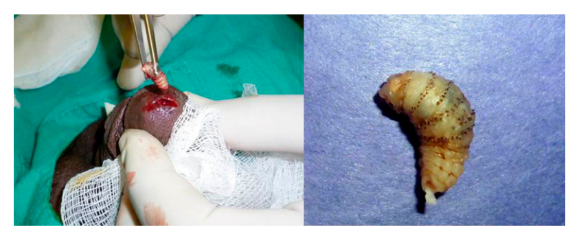
FIGURE 3. Surgical removal of D. hominis larva.

Myiasis is an infestation of vertebrate hosts by larvae of flies that feed on living tissue, body fluids, or ingested foods. Furuncular myiasis is transmitted to vertebrate animals by a hematophagous insect, on whose abdomen a female botfly has deposited her eggs. When the blood-feeding vector encounters a warm-blooded animal, temperature change leads botfly eggs