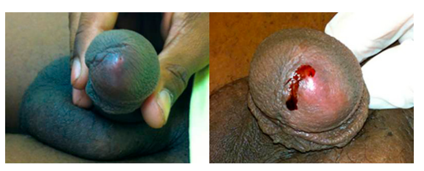
FIGURE 1. Nodule with central pore on the glans penis with serosanguinous discharge.

Instituto de Pesquisa Clínica Evandro Chagas (IPEC), Fundação Oswaldo Cruz (Fiocruz), Rio de Janeiro, Brazil; Department of Infectious and Parasitary Diseases, Hospital Central do Exército (HCE), Rio de Janeiro, Brazil