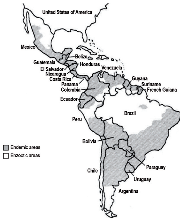
Fig. 2: endemic and enzootic areas of Chagas disease in the Americas. Up to date: Triatoma infestans was eliminated from Uruguay, Chile and Brazil and is under control in Argentina and Paraguay, and Rhodnius prolixus is under control in Central America.

Epidemiological characteristics of Chagas disease in the Americas - Chagas disease in the Americas can be separated into four groups according to the wild, peridomestic and domestic cycles and the situation of human infection and disease (Coura & Dias 2009, Coura et al. 2009).