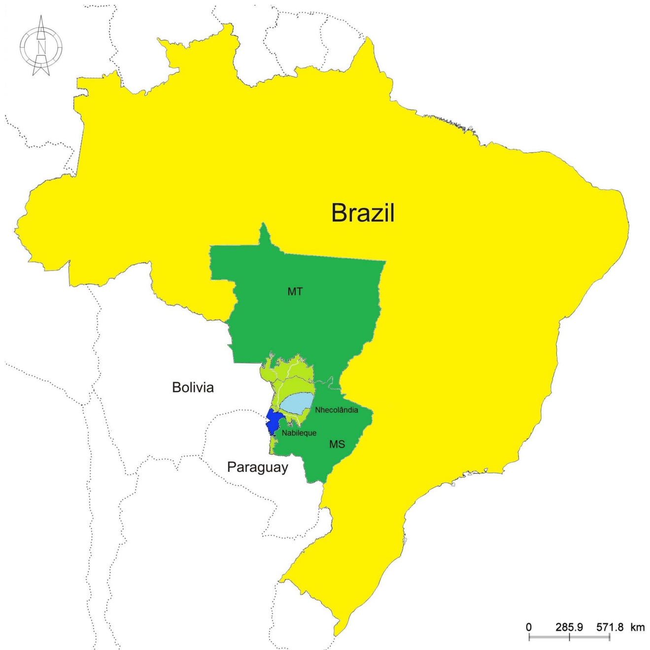
Figure 1. Pantanal located in west-central Brazil. Pantanal located within the states of Mato Grosso (MT) and Mato Grosso do Sul (MS) is shown in light green. Nhecolândia and Nabileque sub-regions, where a serosurvey for flaviviruses was conducted in equines, sheep and caimans in 2009 and 2010 are shown in light and dark blue respectively. doi:10.1371/journal.pntd.0002706.g001

samples had PRNT 90 titer <10 and one <40 for WNV (low sample volume of the latter required testing at a lowest dilution of 1:40). From 238 sheep samples tested, 235 had PRNT 90 titers < 10, two showed low neutralizing antibodies titers of 20 and 10 and one <40. From 760 equine samples initially screened for flavivirus-reactive antibodies by blocking ELISA, 396 (52.1%) were positive. When this subset was tested using PRNT 90 , 332 (43.7%) had neutralizing reactivity (PRNT 90 titer ≥10) for ILHV, 251 (33%) for SLEV, 172 (22.6%) for WNV, 139 (18.3%) for CPCV, 130 (17.1%) for ROCV, 62 (8.2%) for IGUV, 14 (1.8%) for YFV, 12 (1.6%) for BSQV, four (0.5%) for DENV-1, three