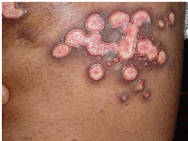
Figure 1. Shallow ulcerations with infiltrated borders that appeared after the evolution to the chronic form of the disease.

twice the normal level. After March 2003 LDH levels began to increase reaching more than three times the normal value. Lymphocytosis increased between April 2004 until the patient died, varying from 8.000 to 9.300 \text{ lymphocytes/mm}^3 . Apart from the oral mucosa and the skin, no other sites of infiltration were found. Monoclonal integration of HTLV-I was detected in peripheral blood mononuclear cells (PBMC) by long and inverse PCR [2]. The skin biopsy performed in 1991 showed a dense infiltration of small and medium pleomorphic cells in the upper dermis. In other two skin biopsies performed in 1994 and 2001 there was a diffuse infiltration of the dermis by medium-sized cells with few large cells. Sparse multinucleated giant cells with pleomorphic nuclei were seen in all the skin biopsies (Figure 2). The atypical lymphocytes were positive for CD45RO, CD3, CD4, CD5, and CD25 and were negative for CD7, CD8, CD30, CD20, and CD79a. The proliferative index evaluated by Ki-67 varied from 5% to 25% in the last biopsy.