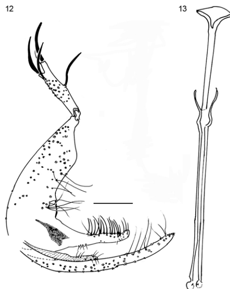
Figs 12, 13: Evandromyia ( Aldamyia ) apurinan sp. nov. Holotype male: 12: terminalia; 13: ejaculatory ducts. Bar = 100 \mu m.