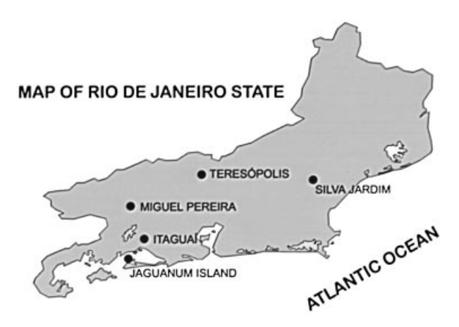
Fig. 1. Map of Rio de Janeiro State showing the 5 studied geographical regions – Teresopolis, Jaguanum Island, Miguel Pereira, Itaguai and the Biological Reserve of Poço das Antas (Silva Jardim).

onstrated that these clusters correspond to 2 major phylogenetic divisions (lineage 1 and lineage 2) of the parasite (Souto et al. 1996). Molecular epidemiological studies performed in 4 distinct geographical areas in Brazil, analysing 86 field recently-isolated stocks from humans (68) and triatomines (18), showed a preferential association of lineage 1 with the domestic cycle and lineage 2 with the sylvatic cycle (Fernandes et al. 1998). These results are consistent with the isozymic dichotomy (Z2 and Z1/Z3) proposed by Miles et al. (1978, 1980). However, a model in which distinct genotypes (lineage 1 or lineage 2) are restricted to either the domestic or the sylvatic cycle does not explain how these cycles are connected. Recently, experimental data derived from 157 T. cruzi isolates collected in non-endemic and endemic regions of Chagas disease in Brazil allowed the proposition of a hypothesis that could clarify the linkage between the domestic and the sylvatic cycles (Zingales et al. 1998).