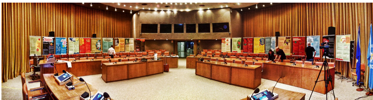
Poster's exposition presenting the 1st Specialisation Course in Global Health and Health Diplomacy final projects. PAHO auditorium, Brasília, DF, Brazil.

In that connection, in spite of the headway that has been made, it is still necessary to develop sound analytical frameworks to contend, on the one hand, with the contradictions and paradoxes that make up the discourses of globalisation and, on the other, with their inter-relations with health issues.