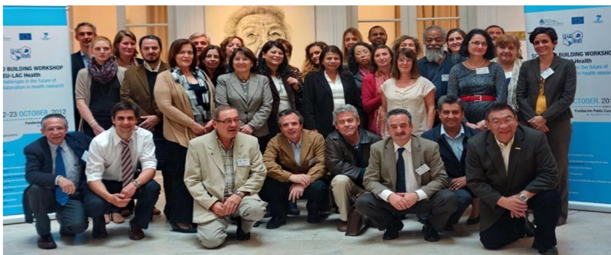
Project’s members and participants in the last day of the workshop held in Buenos Aires

The second “Scenario Building Workshop” will be held in Italy, (Rome) in April 2013. It is planned as a continuation of the Buenos Aires Scenario-Workshop. The results will here be narrowed and worked with aiming at a consensus in common funding acceptable for all countries in the regions and developing a first draft of the common roadmap.