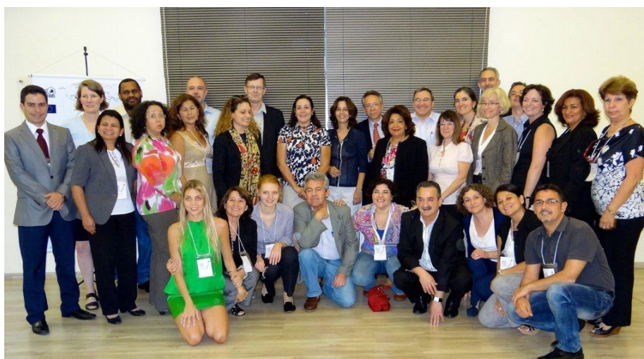
Project's members and participants in the last day of the workshop held in Rio de Janeiro

Project-Homepage with a description, information material, flyers and a complete list of the project partners under: www.eulachealth.eu