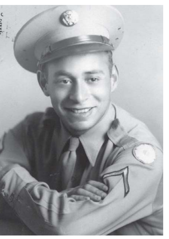
Figure 4: Freidson (1943), aged 20