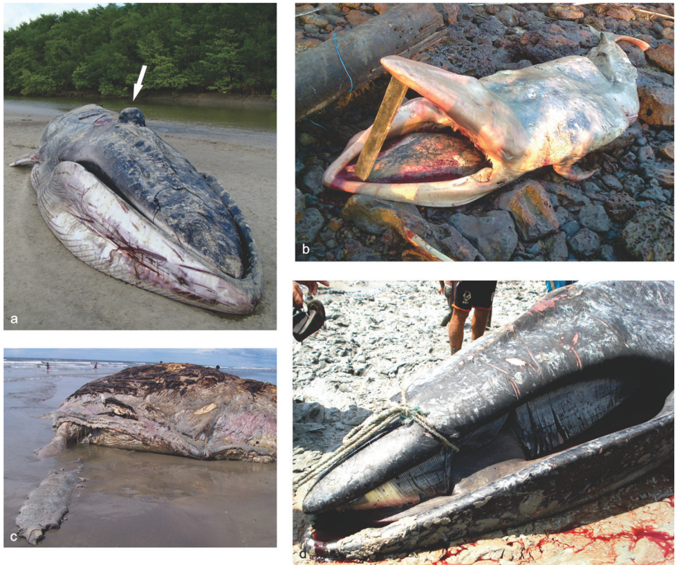
Figure 2. Stranding events: large baleen whales. a Fin whale Balaenoptera physalus stranded at Baía do Japerica, São João de Pirabas municipality ( 0^{\circ}45'S , 47^{\circ}4.2'W ), eastern coast of the Pará state. Note the good condition of the carcass and the strange swelling on the top of the head (see white arrow) (photo by GEMAM/MPEG) b A newborn Bryde's whale Balaenoptera brydei stranded on the east coast of Marajó island ( 0^{\circ}51.6'S , 48^{\circ}30'W ), Pará on 15 September 2012 (photo by GEMAM/MPEG) c Humpback whale Megaptera novaeangliae stranded at Praia do Rio Novo, Tutóia municipality, Maranhão state ( 2^{\circ}42.6'S , 42^{\circ}26.4'W ), note the absence of skull on the carcass (photo by A.F. Costa) d Sei whale Balaenoptera borealis stranded at Fernandes Belo, Viseu municipality ( 1^{\circ}10.8'S , 46^{\circ}5.4'W ), the particular coloration of the baleen plates and slightly arched head are diagnostic characters to identify the species (photo by DEMA/PA).