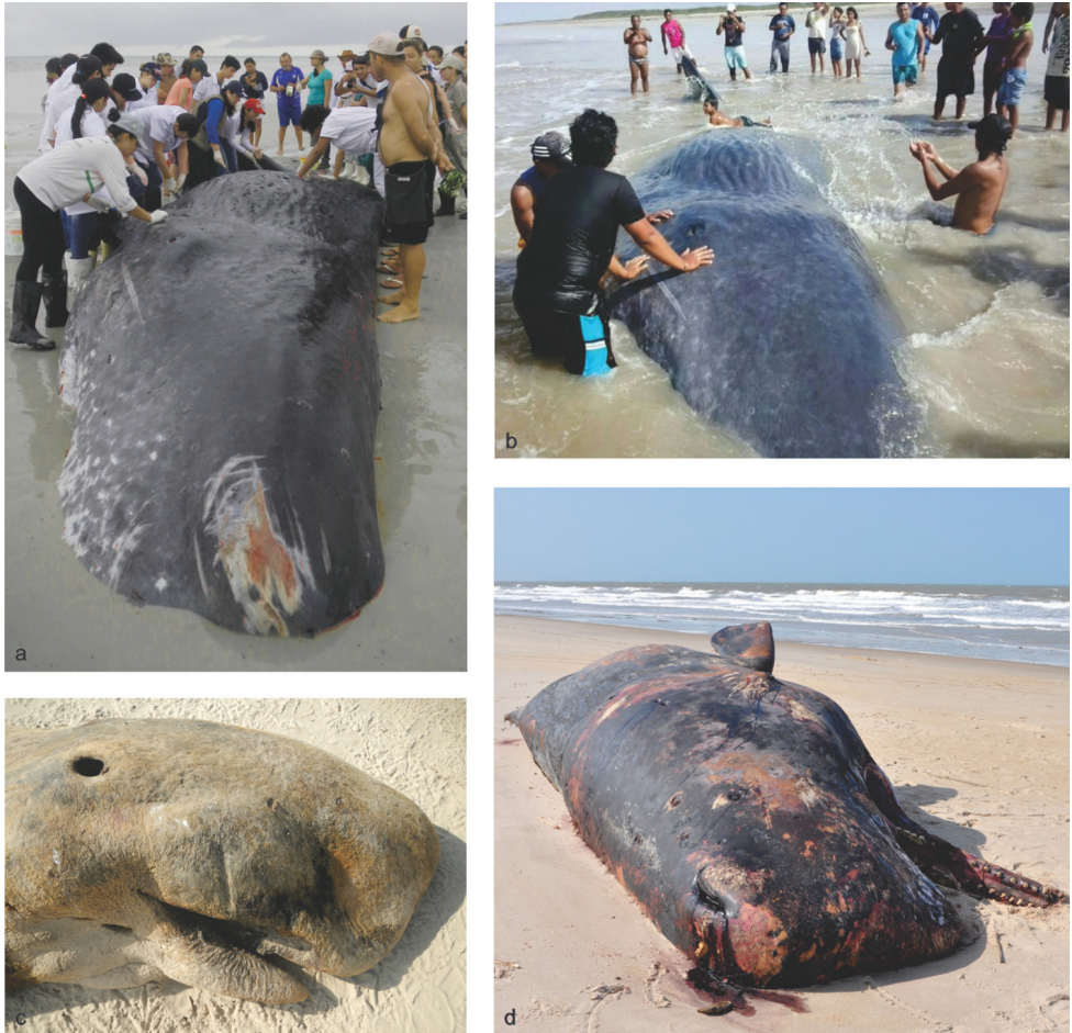
Figure 3. Stranding events: sperm whales. a Sperm whale Physeter macrocephalus (MPEG 42166) stranded at Praia do Crispim, Marapanim municipality ( 0^{\circ}34.8'S , 47^{\circ}38.4'W ) eastern coast of Pará state few hours after death (photo by A.F. Costa) b The same specimen (MPEG 42166) still alive with local people trying to help (internet file) c A newborn Sperm whale (MPEG 42178) stranded at the east coast of Marajó island, Praia do Camburupy ( 0^{\circ}32.4'S , 48^{\circ}28.2'W ) on 2014, note the absence of teeth characteristic of a very young specimen (photo by A.F. Costa) d A female Sperm whale (MPEG 42088) stranded at Praia da Pedra do Sal, Parnaíba municipality, Piauí state coastline ( 2^{\circ}49.8'S , 41^{\circ}41.4'W ) on 2010 (photo by A.F. Costa).