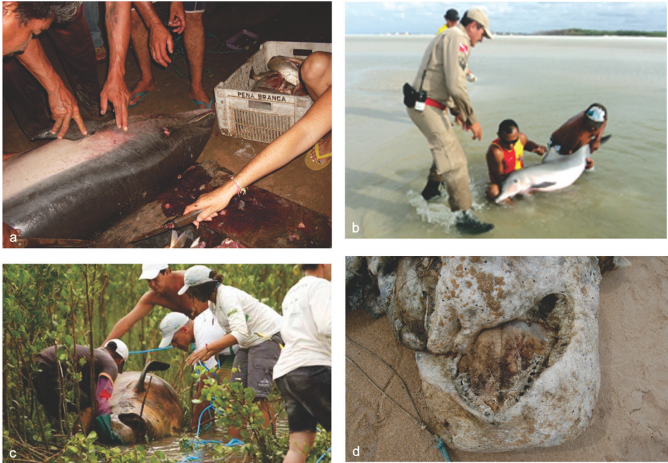
Figure 4. Stranding events: small and medium-sized cetaceans. a The carcass of a Fraser's dolphin, Lagenodelphis hosei was cut down on the village of Carnaubeira, Araisoes municipality ( 2^{\circ}42.6'S , 42^{\circ}0.6'W ) and consumed locally (photo PROCEMA files) b A group of 12 live Guiana dolphins Sotalia guianensis were found trapped (photo showed just one specimen) in a tidal channel alongside Corvina beach, Salinópolis municipality, eastern Pará ( 0^{\circ}36'S , 47^{\circ}22.2'W ) c A False killer whale Pseudorca crassidens stranded on the north-eastern coast of Pará, Praia de Marudá, Marapanim municipality (photo GEMAM files) d A Short-finned pilot whale Globicephala macrorhynchus stranded in advanced stage of decomposition at Praia da Pedra do Sal, Parnaíba municipality ( 2^{\circ}40.8'S , 42^{\circ}31.2'W ), the shape of the head and number of teeth were diagnostic to identify the species (photo PROCEMA files).