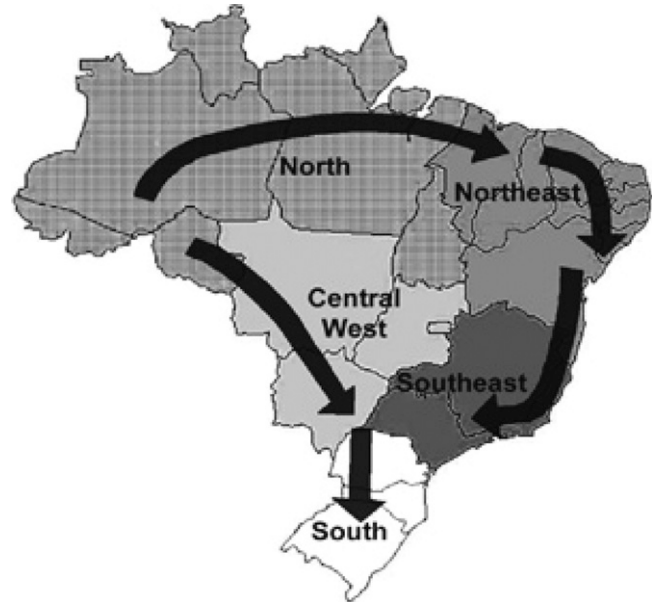
FIGURE 2. Theory of Amazonian expansion of tegumentary leishmaniasis by Leishmania (Viannia) braziliensis . Regions of Brazil are North, Central West, Northeast, Southeast, and South.

Evidence of a negative or decreasing correlation between Ppa or Pp and MLP and the presence of a correlated EPR indicates that there is a larger proportion of TL cases with the cutaneous form evolving to the mucosal form in regions to which this disease is not endemic. This finding suggests a