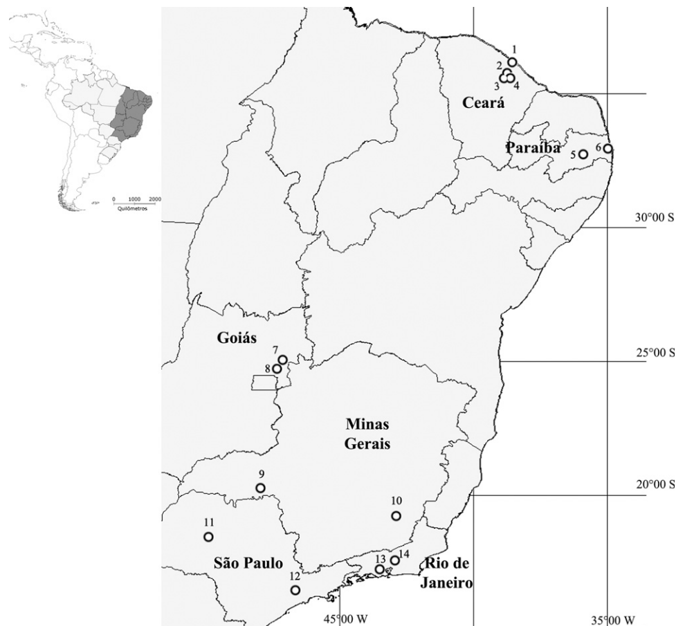
Figure 2. Distribution of the exotic freshwater snail Heliosma duryi in Brazil: 1, Fortaleza; 2, Guaiúba; 3, Acarape; 4, Redenção; 5, Campina Grande; 6, João Pessoa; 7, Vila Boa; 8, Formosa; 9, Uberaba; 10, Viçosa; 11, Promissão; 12, São Paulo; 13, Nova Iguaçu; 14, Guapimirim.

To date, there is no record of threatened native species, risk of economical loss, or damage to public health that could be triggered by the introduction of Heliosma duryi in Brazil. However, this lack of concern may be unwarranted, and preventive measures against the introduction and spread of the species, as well as of others that