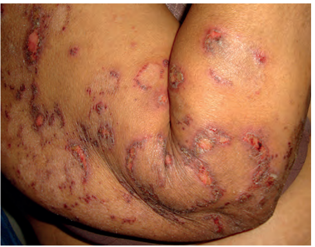
FIGURE 2: Ulcerated areas in the a periphery of psoriatic plaques on upper limbs