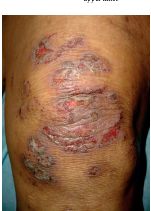
FIGURE 3: In closer detail, on left knee

recommended. She was hospitalized for evaluation of possible hematological and hepatic alterations and started receiving folinic acid 25mg/day intravenously.