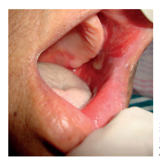
FIGURE 1: Ulcerated lesion on oral mucosa