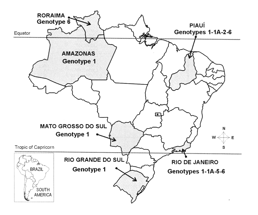
Fig. 2 Map of Brazil showing the geographic distributions of AFLP genotypes of the C. neoformans species complex.