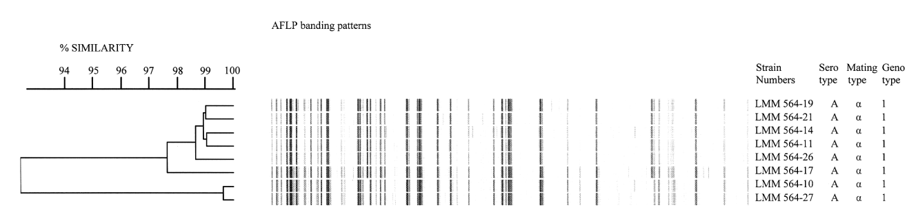
Fig. 4 UPGMA tree of AFLP banding patterns of C. neoformans var. neoformans isolated from another single pink shower tree hollow (LMM 564).