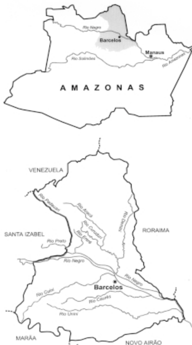
Fig. 1 - District of Barcelos in the microregion of Rio Negro, State of Amazonas

extracted and transferred, through an automatic pipette with an individual point for each serum, to one of the six microtubes of the ID Chagas Test kit, with the red colored polymer particles, sensitized with three different synthetic peptides of T. cruzi antigens, previously homogenized. The combination of the serum and the polymer particles was incubated at room temperature, for 15 minutes; then, it was centrifuged in a special equipment for the kit, for 15 minutes more, according to the fabricant instructions. For each group, it was added a control serum positive, and another one, negative. In the positive considered sera, it was formed a red line on the top, as consequence of the adherence occurred between the particles and the antibodies; in the negative ones, a precipitate was formed on the microtube's bottom, after the centrifugation (Fig. 2). The sera considered positive, according to this technique, and a sample of the negative ones were tested afterwards by the indirect immunofluorescence reaction and by ELISA with purified soluble antigens,