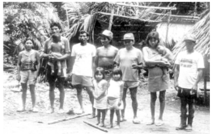
Fig. 3 - Piçavas' workers and their families outside the huts in the work place

Risk factors for Chagas disease: During the individual questionnaires, people were shown a collection of triatomines and 206 individuals (20.7%) recognized at least one of the bug species. Most of them (67.5%) saw the bugs at piçava 's palm trees; 36.4% of these worked on the extractive process of piçava ( Leopoldinia piassaba ) and the others were the workers' family members or companions (Fig. 3). Among the triatomines, the Rhodnius was mostly identified (60.7%). From the 206 individuals who identified the triatomine, 62 (30%) told that had already been bitten by the bug, mostly in a piçava 's growing area. Among the individuals bitten by the bug, 25.8% had positive serology for T. cruzi infection, while among the ones who had not been bitten, only 11.7% had positive serology ( p = 0.03 ); what indicates a positive association between contact with triatomine and positive serology.