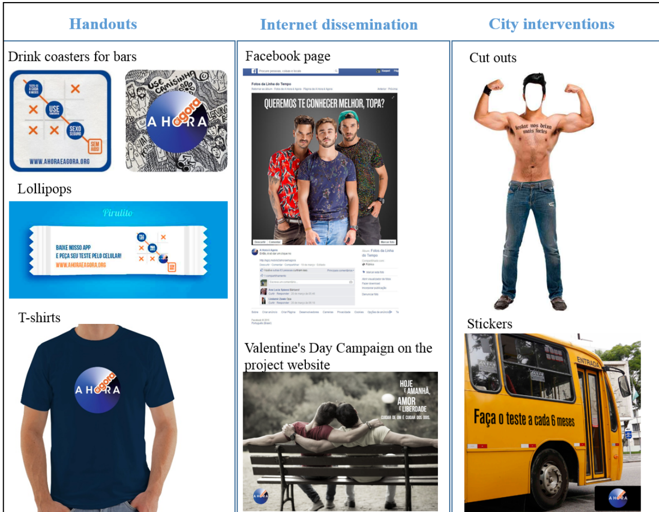
Figure 1. Sample of the “A Hora é Agora” communications strategy for Curitiba, Brazil (2015-2016).