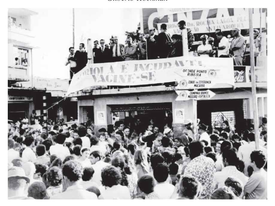
Figure 4: Politicians, officers and public health staff at the opening of the Smallpox Eradication Campaign, city of Natal, state of Rio Grande do Norte, north-east of Brazil, 1970. (Claudio do Amaral papers, COC-Fiocruz.)

National Epidemiological Surveillance System (Sistema Nacional de Vigilância Epidemiológica) established formally in 1975.<sup>89</sup>