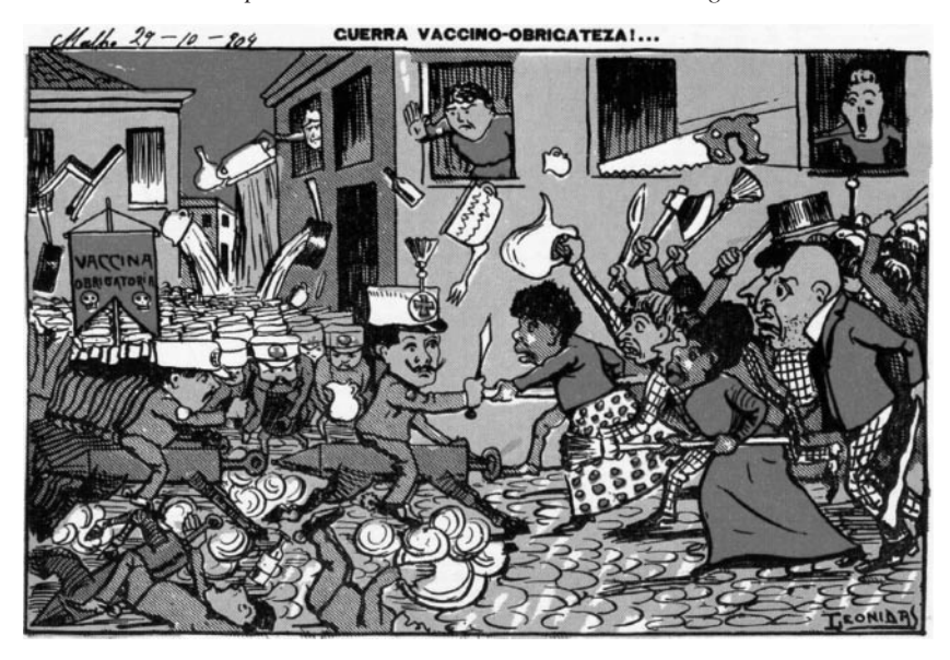
Figure 1: 'War against the compulsory vaccination!', published 29 October 1904, Revista O Malho, reproduced in Edgard de Cerqueira Falcão, Oswaldo Cruz monumenta histórica. A incompreensão de uma época. Oswaldo Cruz e a caricatura, vol. VI, t. I., São Paulo, s.n., 1971 (Coleção Brasiliensia Documenta), p. CXXIX.

Once the most turbulent period was over, smallpox vaccination continued to be implemented and was slowly incorporated into the daily life of the capital and in the other main cities in the country. Mortality swiftly declined, reaching almost zero in 1906. The vaccination campaigns initiated by Oswaldo Cruz in 1904 had an important role in the decrease of smallpox cases for two subsequent decades, although a few important outbreaks interrupted the trend. For example, a new epidemic paralysed the capital in 1908, only four years after the Vaccine Revolt, causing an unusually high mortality rate of 1,000 per 100,000 inhabitants; a total of 9,900 cases was registered, surpassing the epidemic outbreaks of 1887 and 1891. Nevertheless, there are no records of popular organized resistance to vaccination in 1908 nor in the outbreaks of 1914 nor in 1926, when the last epidemic struck Rio with over 4,140 reported smallpox cases.