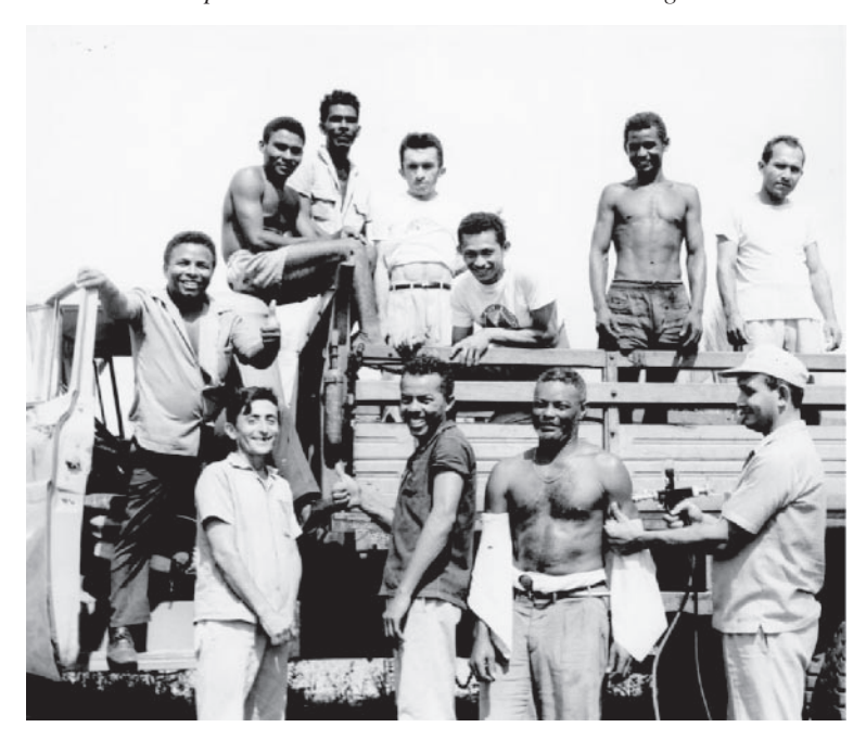
Figure 3: Vaccination of seasonal rural workers, state of Maranhão, north-east of Brazil, 1969.

simultaneously with mass vaccination activities and then continue after the attack phase had been completed. However, as a result of financial and operational difficulties, an epidemiological surveillance system was not implemented until 1969, when the number of reported cases reached the highest level since the beginning of the smallpox campaign in 1966. The lack of good surveillance was reported to PAHO/WHO as a major barrier to eradication. After the creation of Epidemiological Surveillance Units (Unidades de Vigilância Epidemiológicas) and Reporting Posts (Postos de Notificação) at the end of the decade, the data problem began to recede. These new surveillance functions became the responsibility of each state in the consolidation phase of the campaign, reinforcing the link among different governmental spheres. By 1970 every state in Brazil had established an Epidemiological Surveillance Unit, and there were 6,074 Reporting Posts covering 90 per cent of Brazil's municipalities. These represented the embryo of the