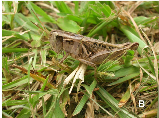
Figure 2. Dichroplus obscurus , Male (A) and Female (B), collected in Posadas.