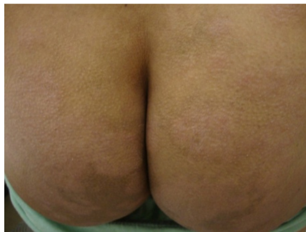
Fig. 4 - Patches and paresthesia in the buttocks.