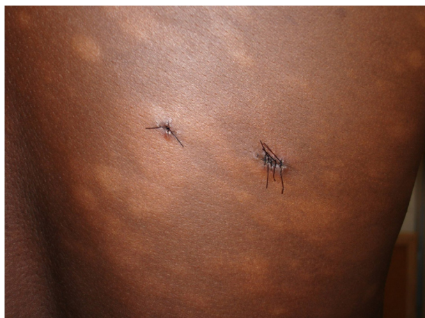
Fig. 1 - Disseminated patches and paresthesia.