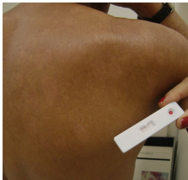
Fig. 3 - Patches and paresthesia in the trunk and positive serology test (AntiPGL-1) in 2009.