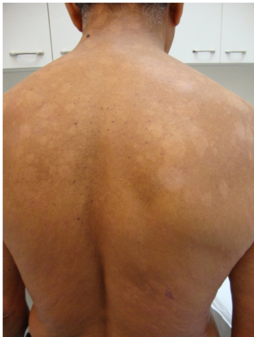
Fig. 6 - Skin lesion improvement seven months after the MDT-Biopsy .

inflammatory answer to persistent Mycobacterium leprae , but that they could be.