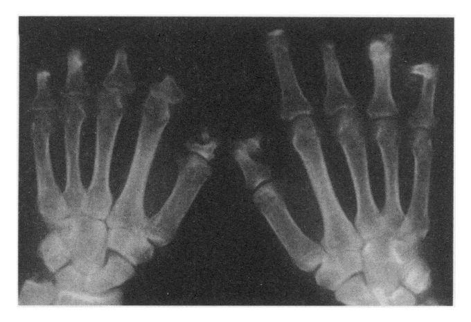
Figure 2. Case 1. Anteroposterior X-ray of hands showing various patterns of bone resorption: lateral, frontal and distal osteolysis with fragmentation. Also subluxation of 1st, 4th and 5th distal interphalangeal articulations.

ulcers and successive episodes of osteomyelitis, which led to amputation of two fingers and continuous extrusion of sequestra. Chronic Achilles tendonitis and severe acral deformities developed (see Figure 2).