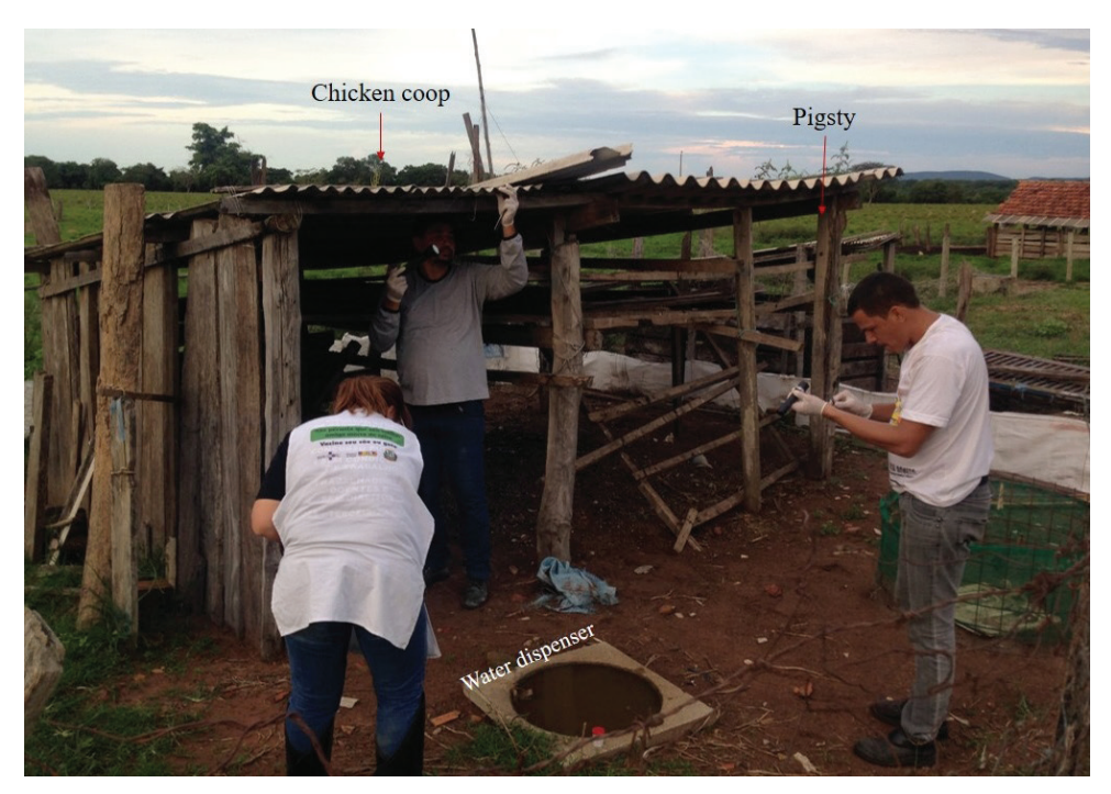
Figure 3. Chicken coop on "Fazenda Lago Azul", Araguaiana, Mato Grosso, Brazil where the nymph of Triatoma sordida was found.