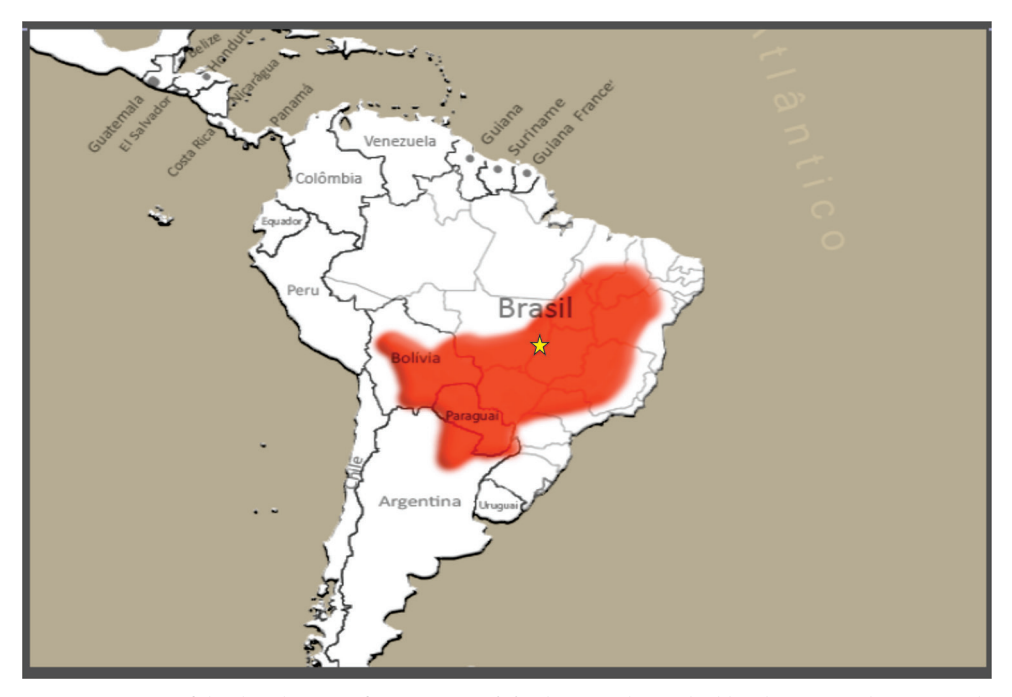
Figure 1. Map of the distribution of Triatoma sordida , showing the studied locality "Fazenda Lago Azul" in Araguaiana, Mato Grosso, Brazil (15°43'47"S, 51°49'26"W).

During the standard procedure for the extraction of intestinal content of a nymph of a third stage T. sordida (15 mm deep), a long and slim parasite was observed emerging from the triatomine (Fig. 2).