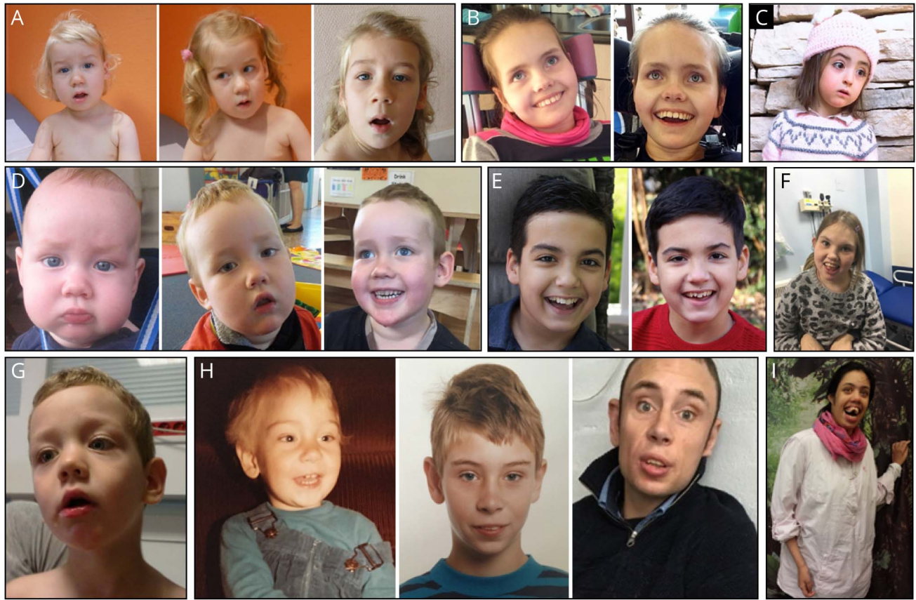
Faces of patients with pathogenic PURA variants. Recurrent similarities include a myopathic face, high anterior hairline, almond-shaped palpebral fissures, and full cheeks. A flat nasal bridge with a wide and triangular nasal tip, thickened nostrils, a well-defined philtrum, heavy eyebrows, and periorbital fullness was seen in a subset of individuals. PURA = purine-rich element-binding protein A.

the 37 patients (18.9%), respectively. Four children (10.8%) presented with an excessive activation of the epileptic abnormalities during sleep (resembling an electrical status epilepticus during sleep [ESES] pattern), whereas hypsarrhythmia and burst suppression were observed in 3 patients (8.1%) each (Figure 2).