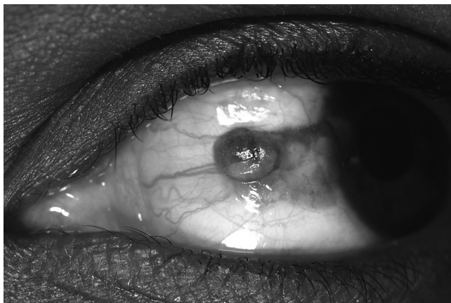
Fig. 1. Conjunctival lesion medial aspect left eye.

An enzyme-linked immunosorbent assay HIV test was positive. The CD4 cell count was 143 cells/mm 3 and the viral load was 13 400 copies/ml. She was commenced on